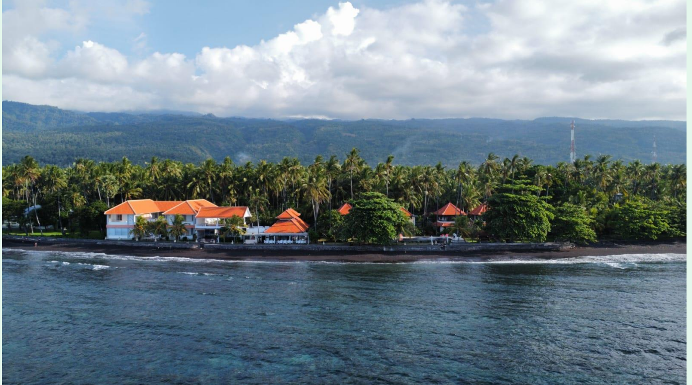
Bondalem Beach Club aerial view